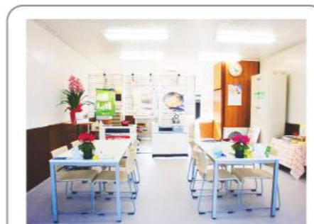
Eco showroom where you can experience cooking on an IH cooking heater and observe solar panels and EcoCute.

1-23-1 Fukada-cho, Toyota City, Aichi Prefecture 471-0841 TEL: +81-120-957-740 http://www.fukaden.co.jp/eco/