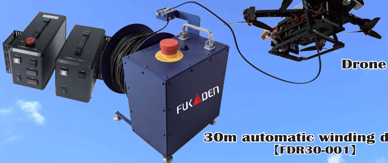
30m automatic winding device 【FDR30-001】